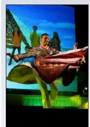
Joseph: Musicals in Motion

Musicals in Motion, The Leatherhead Theatre, Saturday January 10, 7.30pm, £15.50 (£12.50), 01372 365141, www.the-theatre.org